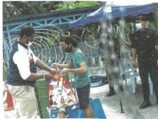
Taman Langat Utama and Taman Langat Murni in Banting have been put under semi-Enhanced Movement Control Order since a new Covid-19 cluster involving workers of a cleaning company in the area was detected on Thursday.

"For example, a patient tested positive for Covid-19, but the virus caused blood clots in the