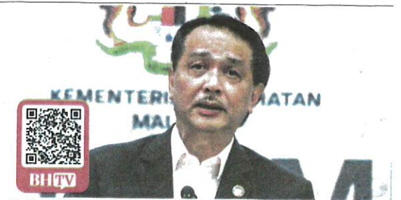
Dr Noor Hisham pada sidang media harian COVID-19 di Putrajaya, semalam.

Dr Noor Hisham berkata, mana-mana warga asing yang didapati positif selepas ujian saringan kedua juga sudah diasingkan dan